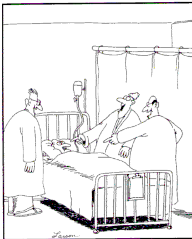
Testing whether laughter is the best medicine

I wanted to communicate something of the tragic comedy out of which this study was born. Of course, those readers who understand and can identify with the experience(s) articulated in APPENDIX A and with the arguments of the devil's advocate's case against realism should be capable of finding more than just comic relief. There is indeed a deeper allegorical meaning and a darker, somewhat melancholic and bitterer type of humour latent in these cartoons in their present context.