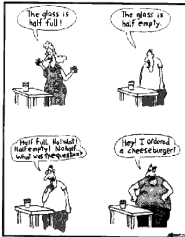
The four basic personality types

Given this scenario, reaction to the title of this thesis and its reconstruction of a “case against realism” might be quite diverse.